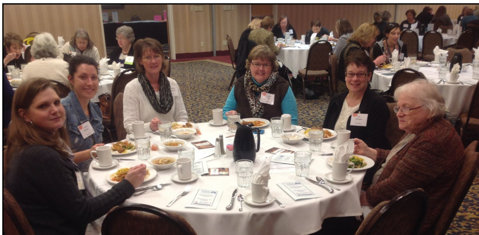
MAFCS members enjoyed time networking and sharing ideas with each other.

My favorite conference highlight was the Digital Property session. Who knew there was such a thing! I attended the breakout session on this subject and truly had my eyes opened to a piece of the digital world I had never thought about. Who knew your iTunes or downloaded movies and books have true value. What happens to this property when you pass away? What happens to your Facebook and Twitter accounts? What I learned is that we need to inventory those things of value and think about who should get access to those accounts when we are no longer around. Your digital property is just like your tangible property and needs to be included in the valuing of your estate. WHO KNEW!!